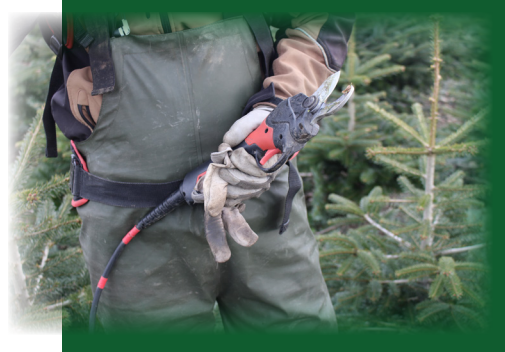
Hand Basal Pruning Using Power Secateurs