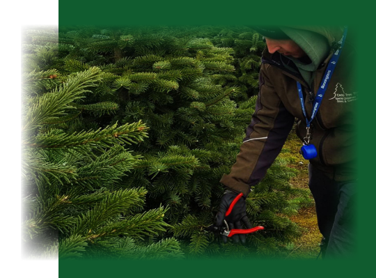
Experienced Pruning Staff