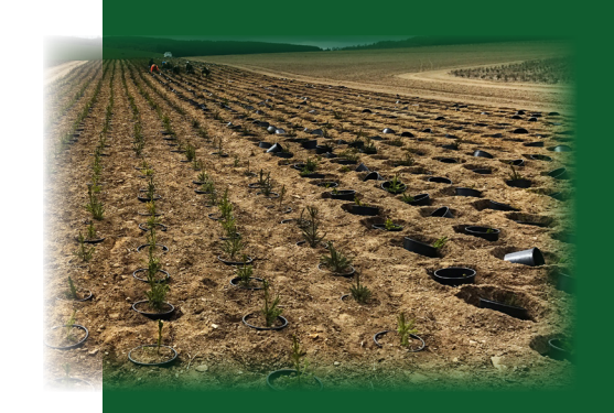
Pot Grown Planting