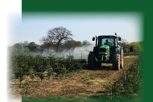
Fungicide and Incesticide Treatment With our Dragone Mistblower

All Prices aere Subject to VAT and Travel Expenses