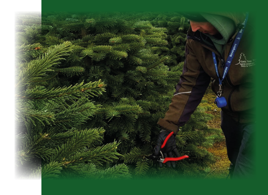
Experienced Pruning Staff