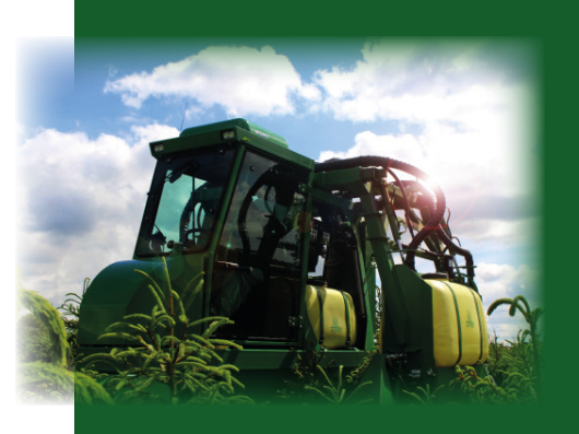
Inter-Row Spraying With Our Jutek Specialist Christmas Tree Tractor