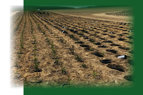
Pot Grown Planting