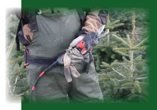
Hand Basal Pruning Using Power Secateurs