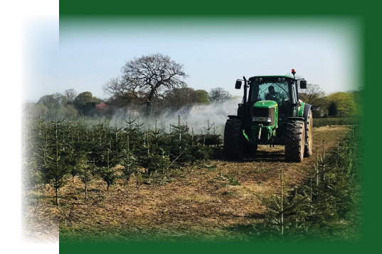
Fungicide and Insecticide Treatment With our Dragone Mistblower